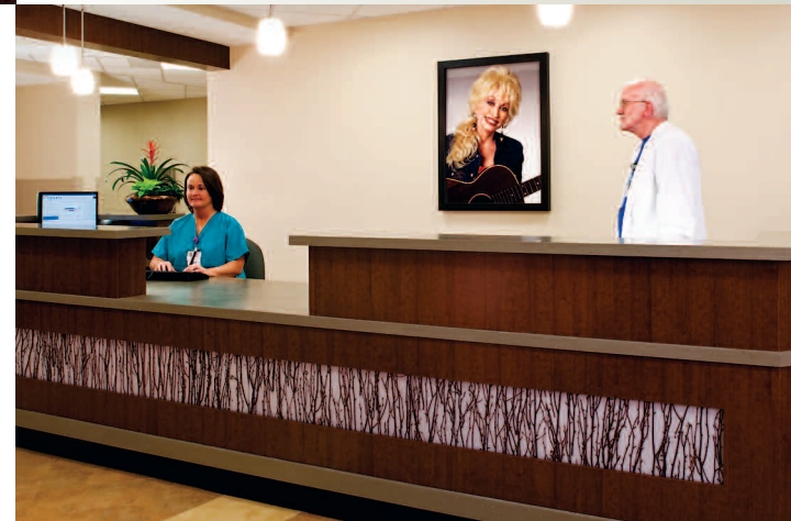
The health unit coordinator station of the Dolly Parton birthing unit features a photograph of its benefactor, while birch twigs sandwiced within composite inlay panels grace the front of the desk.