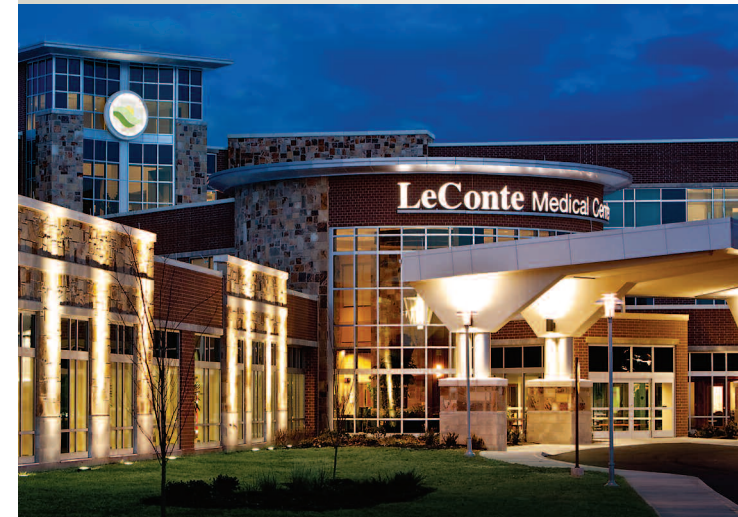
Lighting provides a softened accent to both the entry canopy and the natural stone utilized on the exterior, which is indigenous to the East Tennessee region.

Cast-stone copings were changed to a metal material of the same color that cost less, was easier to install and looks the same from ground level. The original design also called for a local, rounded river rock in place of the indigenous cut stone used in the final building. Driskill says trying to build with river rock to achieve both aesthetically pleasing and water-tight results proved difficult. “The change we made in the stone was particularly beneficial,” he says. ■