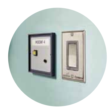
MAKING THE SWITCH

PURETi dries instantly to an invisible finish and gives surfaces self-cleaning and air-purifying properties.